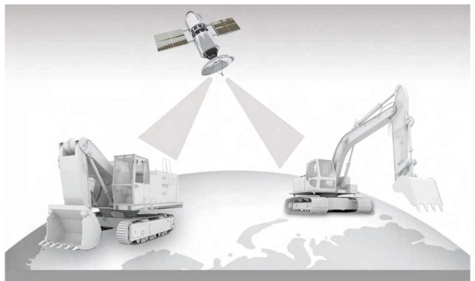
Tracking & Monitoring for Construction Equipment

This systems are used to recover stolen machines or monitor rental machines and manage their maintenance efficient. The administration can be done easily and securely by the manufacturers or distributors with web applications.