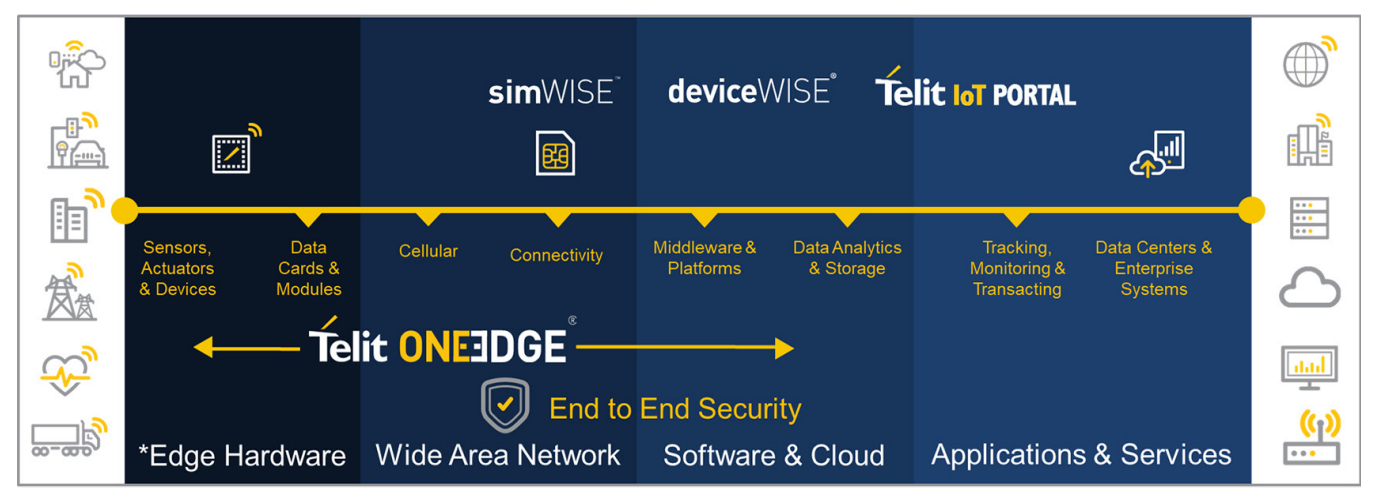
Figure 1: The four stages of The First Mile of IoT.

This part of the IoT journey is the most important. When done right, it ensures organizations can acquire timely and reliable data in a form they can consume, adds value and drives the required business outcomes. Let's take a closer look at the four critical stages of <u>The First Mile of IoT</u>.